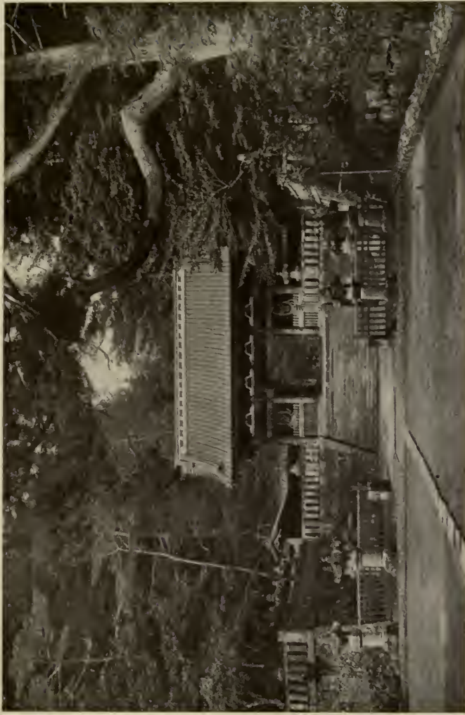
NIOMON IYEMITSU TEMPLE AT NIKKO.